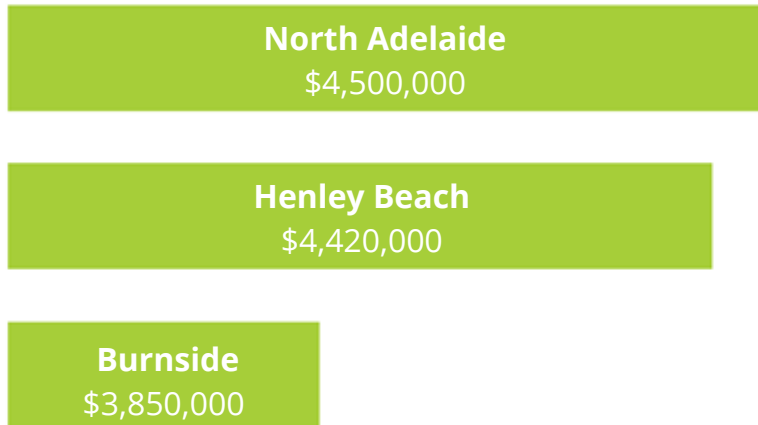
TOP 3 SUBURBS

The highest value market sales for January 2021 were recorded in the suburbs of North Adelaide, Henley Beach, and Burnside.